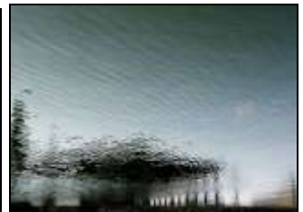
Sanam Ghods: No Title