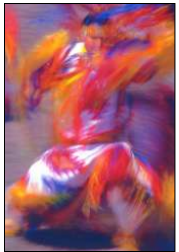
Rosemarei Culver: Flying Feathers