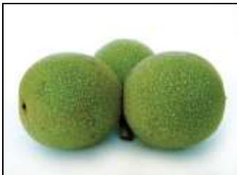
Farzad Emami: From The Fruits Collection