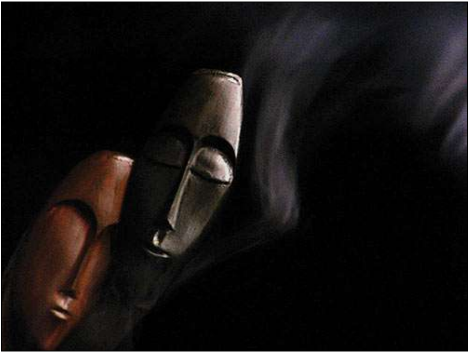
First Selected Work: Homeira Yaseri