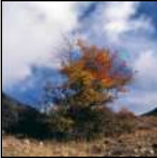
Shahin Shahablou: No Title