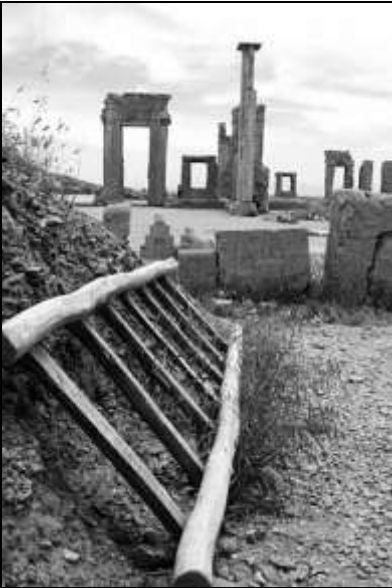
Shahabeddin Ettekal: Greatness Radical