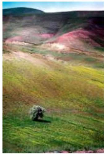
Guity Shojai: Happiness Plain