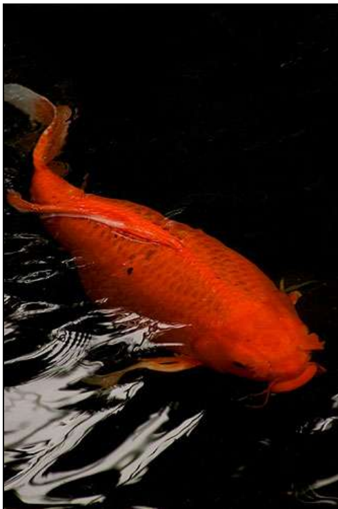
Forth Winner: Farhad Varasteh