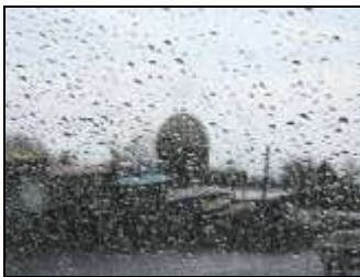
Dorre Araki: Drops