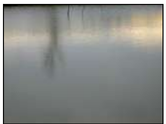
Keivan Pour Nasri Nejad: Nostalgia