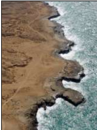
Saeed Dehghani: No Title