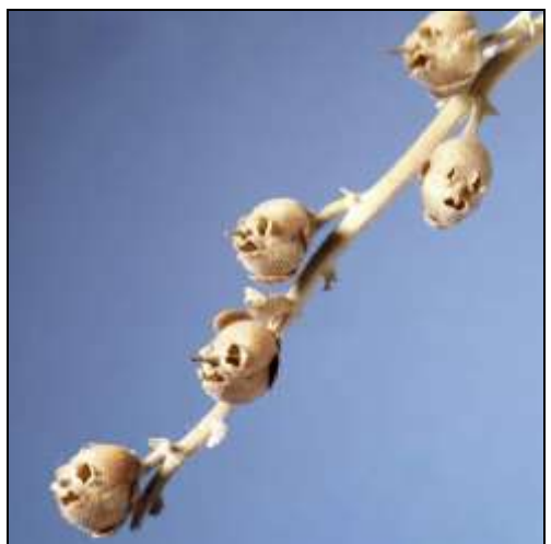
Sayeh Sayar: Plant