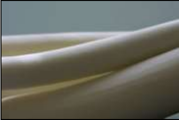
Nahal Chizari: The Softness of Nature