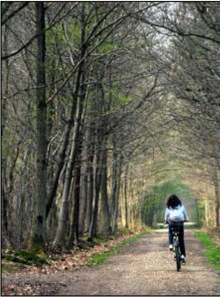
Sahar Seyedi: No Title