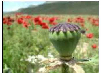
Masoud Mohsen Zadeh: Lar Plain