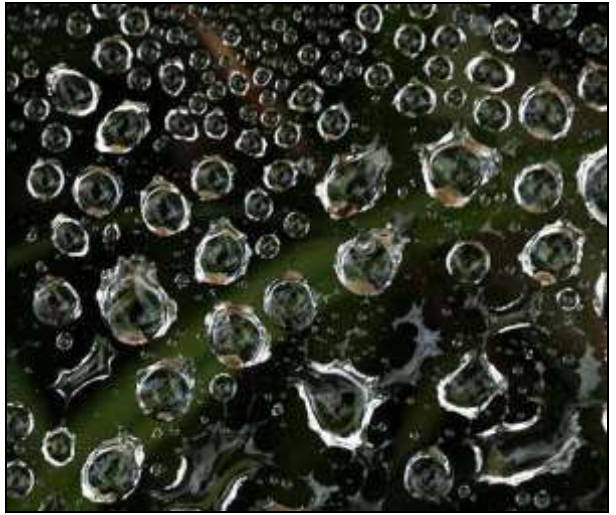
Abooza Reza Vanaki: Closed