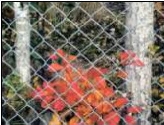
Banafsheh Hejazi: Reds